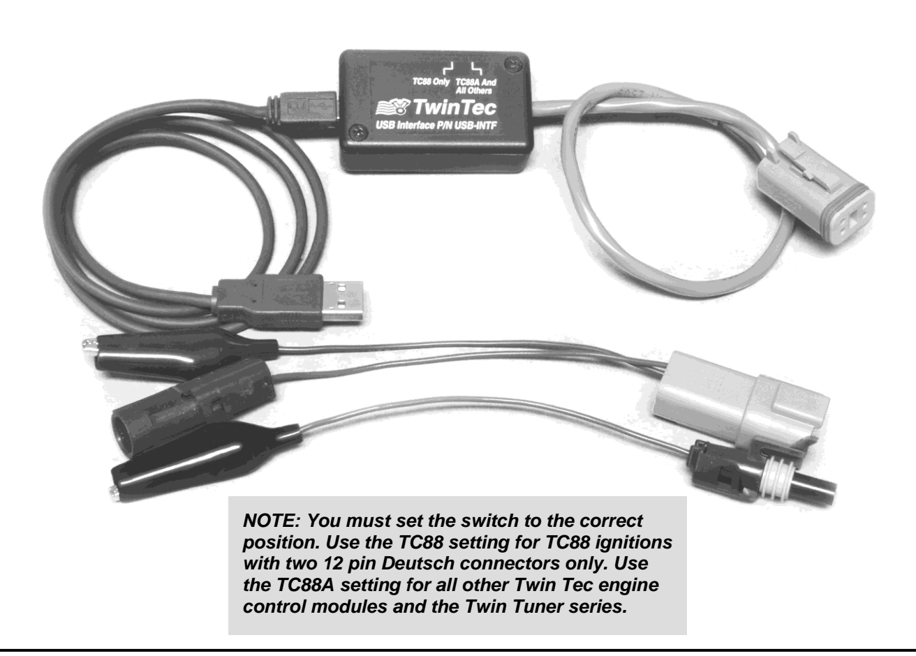
Figure 1 – Twin Tec USB Interface with Adapters

Daytona Twin Tec, 240 Springview Commerce Dr., Bldg 1 Ste J, Debary, FL 32713 (386) 304-0700 www.daytona-twintec.com